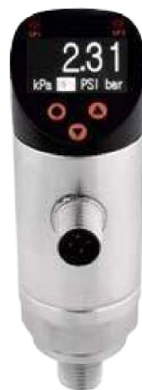
Digital Pressure Switch - Transmitter